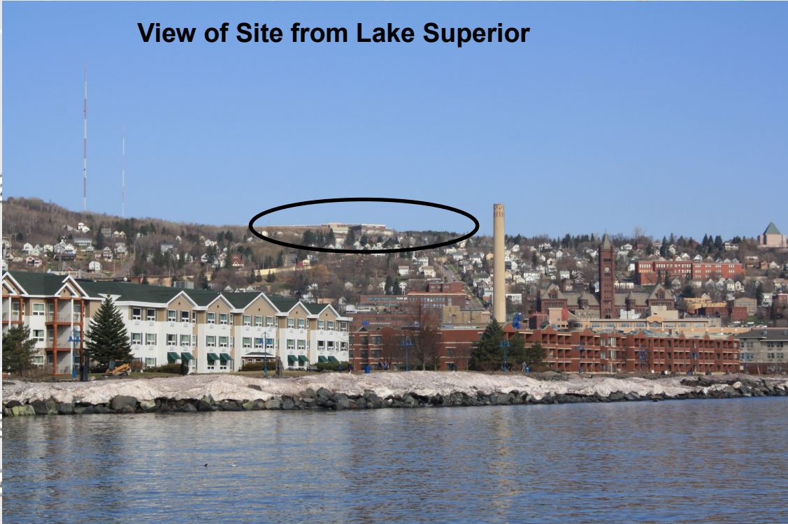
View of Site from Lake Superior